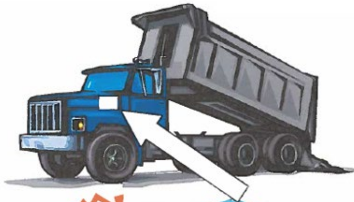
Right & Left Front Panel